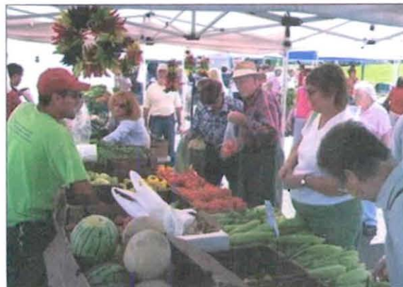
(Continued on page 2)

Bring the whole family to opening day and sign the kids up for the first annual Waterland Children Arts Festival sponsored by the Des Moines Arts Commission and Parks and Recreation Department. Kids can gather their artistic inspiration from the handful of unique crafters at the market. The market has part-