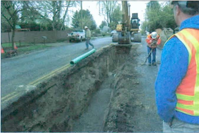
Construction for sanitary sewers on S. 260th St.

Background: Scarsella Brothers Inc. has been contracted by the City to begin rebuilding 16th Ave. S. In partnership