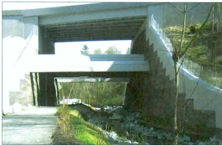
Work continues on the stream channel under the new Marine View Drive Bridge.

This summer the existing stream culvert will be abandoned and the creek will be fully channeled into the new stream section. Once the culvert is abandoned, over two more miles of stream will be made available for fish habitat.